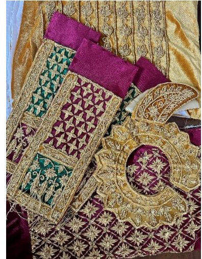
Male costumes matching the Documentation from the 1960s